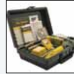
SamplerPak motorized pump