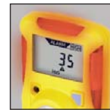
Easy to See