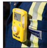
Easy To Wear