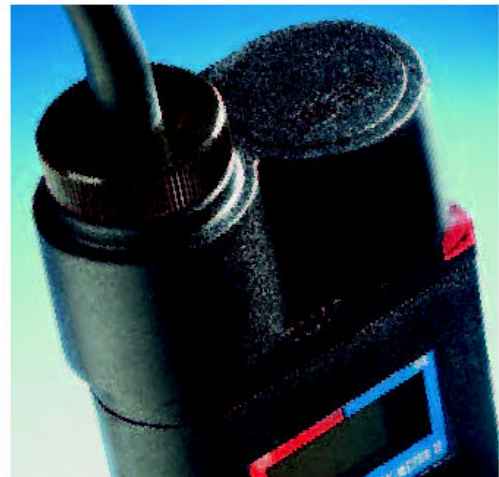
All EX-METER II and EX-OX-METER II instruments can be supplied with an integrated pump. The sampling is by diffusion; with the pumped version the attachment of a pump adapter [see above] permits sampling with an electric pump, sampling line and probe.

One to four integrated measuring ranges, calibrations of choice, pumped versions as standard and practically unlimited service time by intrinsically safe, rechargeable battery packs that can be changed in the hazardous area – all the above features of the EX-METER II are proof of the innovative design at MSA.